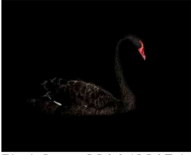
Black Swan, 2014/2015/3/12 [edition includes two artist copies]