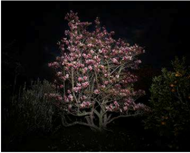
Day for Night Magnolia, 2014/2015/1/12 [edition includes two artist copies]