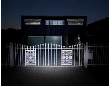
Day for Night fence, Takapuna, 2014/2015/1/12 [edition includes two artist copies]