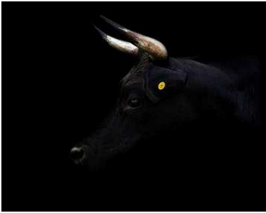
Bull 141, 2015/2015/1/12 [edition includes two artist copies]

Digital pigment prints on Epson Hot Press Natural 310gsm