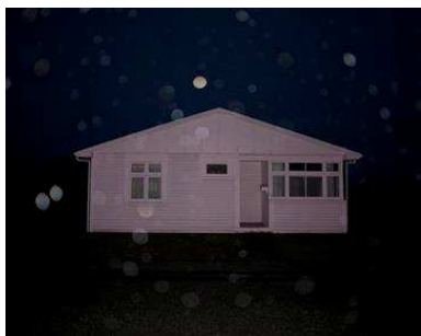
Day for Night house, Hokitika, 2014/2015/2/12 [edition includes two artist copies]

Day for night stills for 'The Members' a film about a benign cult located west of a city in NZ