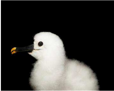
Awkward Baby, 2014/2015/1/12 [edition includes two artist copies]