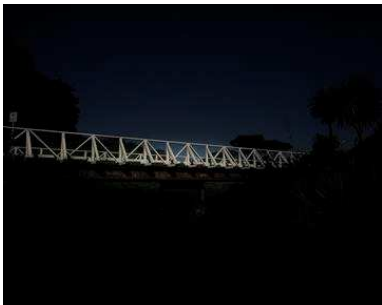
Bridge, 2014/2015/1/12 [edition includes two artist copies]