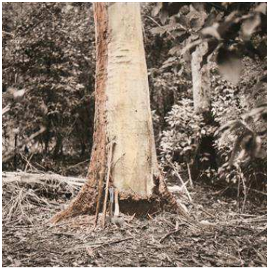
Un-resetting [Happenings], Debarked tree, 2014/2015/2/7 [includes two artist copies]

Hand-coloured inkjet print on photorag paper