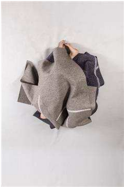
Stone bird , 2013/2015/1/7 [includes two artist copies]

Pigment print on Moab Entrada Rag Bright