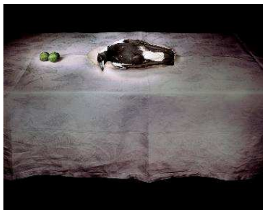
Magpie with limes , 2006/2008/1/10

Digital image, printed as Giclée pigment print on cotton German etching paper 700 x 900mm Aust$4,000