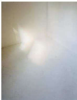
Moving out #5 , 2012/2012/4/6 [includes one artist copy]