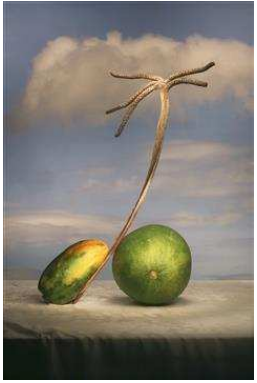
Pawpaw with umbrella flower , 2014/2015/2/10 [includes two artist copies]

Digital image, printed as Giclée pigment print on cotton German etching paper