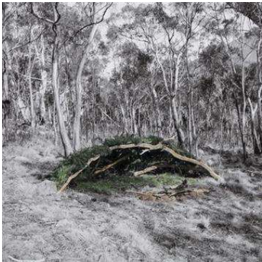
Un-resettling [Dwellings], fallen tree half dome hut, 2013/2015/2/7 [includes two artist copies] Hand-coloured digital print 420 x 420mm Aust$650