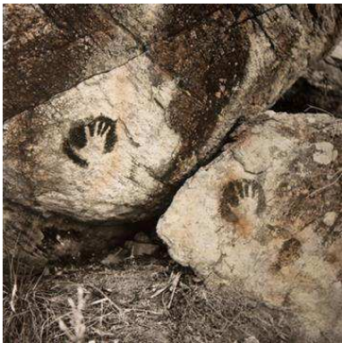
Un-resetting [Happenings], Handprints on rock, 2014/2015/2/7 [includes two artist copies]

Hand-coloured inkjet print on photorag paper