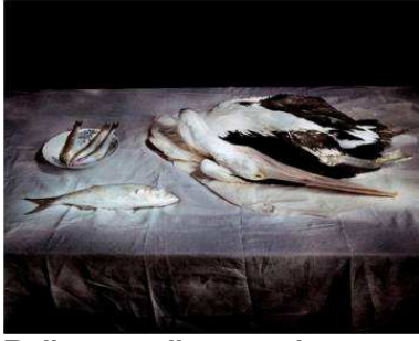
Pelican on linen and paper , 2003/2008/8/10

Digital image, printed as Giclée pigment print on cotton German etching paper