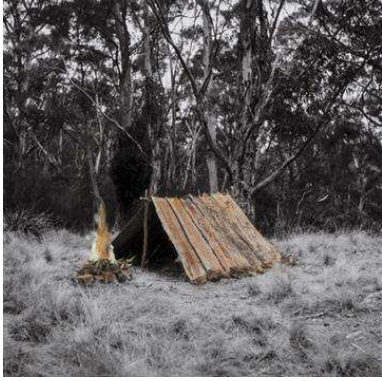
Un-resettling [Dwellings], A-frame hut, 2013/2015/2/7 [includes two artist copies] Hand-coloured digital print 420 x 420mm Aust$650