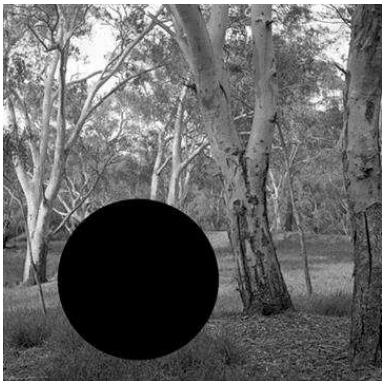
[Erased scenes] From an Untouched landscape #5, 2014/2015/2/7 [includes two artist copies] Inkjet print on Hahnemuhle paper with hole removed to a black velvet void, 500 x 500mm Aust$670