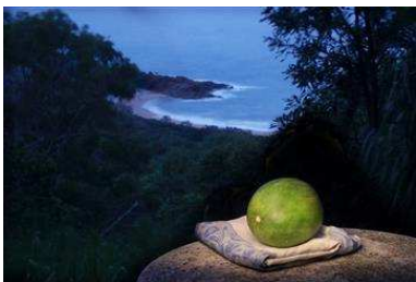
End of the picnic , 2015/2015/1/10 [includes two artist copies]

Digital image, printed as Giclée pigment print on cotton German etching paper