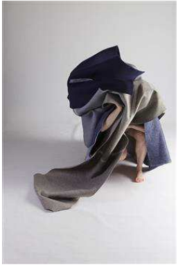
Slender-throated warbler , 2013/2015/1/7 [includes two artist copies]

Pigment print on Moab Entrada Rag Bright