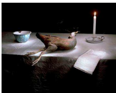
Swamphen with candle and bowl , 2005/2008/1/10

Digital image, printed as Giclée pigment print on cotton German etching paper 700 x 900mm Aust$4,000