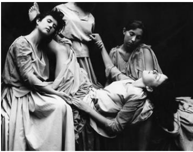
Scene III , 1986/2009/3/5