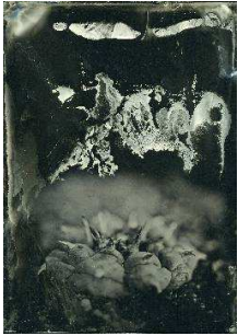
Joyce Campbell: Peyote , 2007 Ambrotype