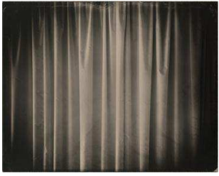
Ben Cauchi: Curtain (close) , 2011 Wet collodion on Acrylic