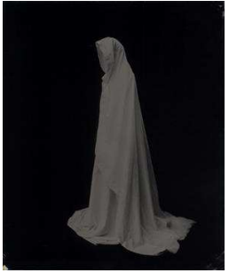
Ben Cauchi: White Shroud [alternate plate] , 2006