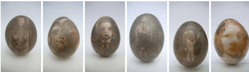
Aaron Seeto [Australia] From the 1000 other things, 2001/2007

Silver-Salt photographs on duck egg shell