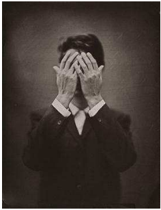
Ben Cauchi: from: The Doppler Effect portfolio 2010