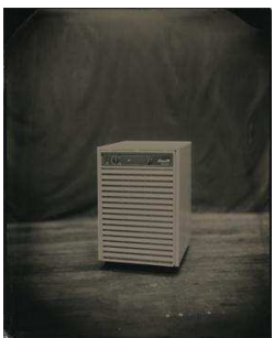
Ben Cauchi: Humidity 2010 Wet collodion on Acrylic