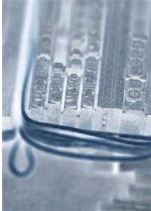
Anne Noble: Securing the shadow #6 , 2013

Pigment inkjet print [from Digital image] on Canson paper