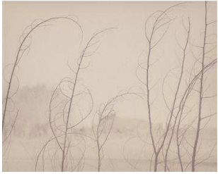
Wayne Barrar: Edge of the Wairau River (south bank), Marlborough 2011

Contact print Printing-Out Paper Gold toned