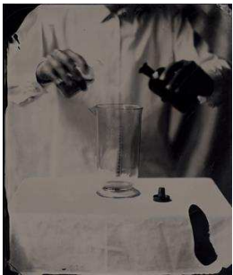
Ben Cauchi: Mixing Solutions , 2003 Ambrotype