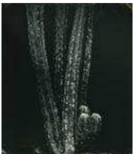
Joyce Campbell: San Pedro, 2006

Silver-Salt photographs on duck egg shell