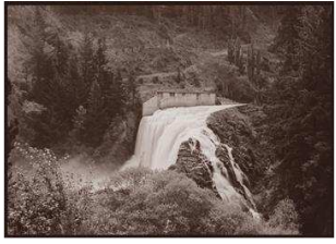
Wayne Barrar: Falling water at Waihopai River dam structure, Marlborough 2012 Albumen print Gold toned

Materiality [Modalities employed in contemporary practice]