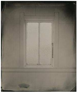
Ben Cauchi: That which came before , 2008