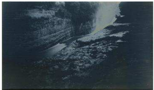
Joyce Campbell: Sometimes she shows herself as a River , 2010 [from: Te Taniwha ]

Daguerreotype - The plates are developed using the Becquerel process, a variant Daguerreotype technique that replaces development by mercury vapour with exposure to amber light.