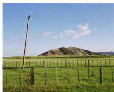
Beach Rd, Rangitukia. Looking across to Pohautea and Nukutaimemeha Waka. 2012/2013/ 1/6 [includes one artist copy]