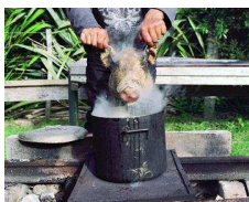
Boiled pig head, Te Rimu, Tikapa. 2012/2013/ 1/6 [includes one artist copy]