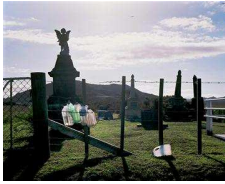
Entry to Okaroro Urupa, Rangitukia. 2012/2013/ 1/6 [includes one artist copy]