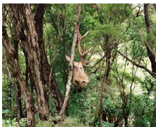
Deer head drying, Te Rimu, Tikapa. 2013/2013/ 1/6 [includes one artist copy]