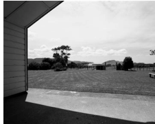
Tikapa Marae. Pokai mahau looking out to Waiapu Ngutu Awa, 2010/2013/ 1/6 [includes one artist copy] 1118 x 930 mm