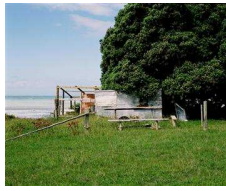
Camp. Omaewa, Port Awanui. 2012/2013/ 1/6 [includes one artist copy]