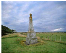
Takimoana monument, Aratia Urupa, Rangitukia. 2012/2013/ 1/6 [includes one artist copy]