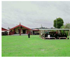
Ihaka Noble delivering whaikorero at Rangitahi Marae, Murupara. On the occasion of the 60th birthday of Takawai Murphy. 2010/2013/ 1/6 [includes one artist copy]

Inkjet prints from 6 x7" negative on Ilford Gold Silk paper Size variable within the edition