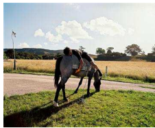
Ashlee Atkins on 'Honey'. Te Rimu, Tikapa. 2012/2013/ 1/6 [includes one artist copy]