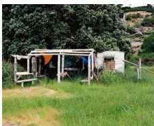
Camp. Omaewa, Port Awanui, 2011/2013/ 2/6 [includes one artist copy]