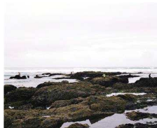
Gathering mussels for the tangihanga for Ralph Hotere. Mitimiti. 2013/2013/ 1/6 [includes one artist copy]