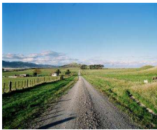
Tikapa Rd looking to Pohautea. 2012/2013/ 1/6 [includes one artist copy]