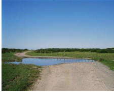
Beach Rd, Rangitukia. 2012/2013/ 1/6 [includes one artist copy]