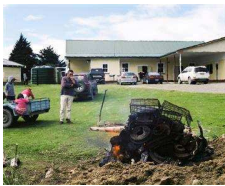
Hangi fire. Rahui Marae, Tikitiki. 2013/2013/ 1/6 [includes one artist copy]