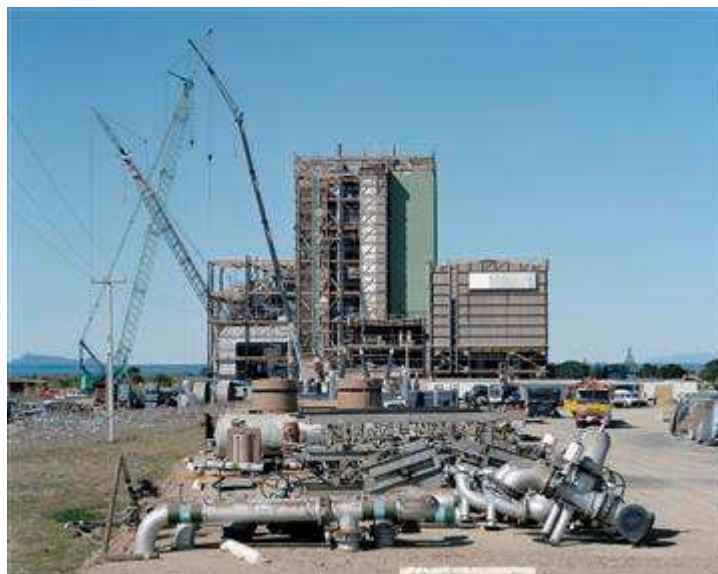
Marsden B Power Station in the process of being dismantled, Marsden Point, 27th August 2011