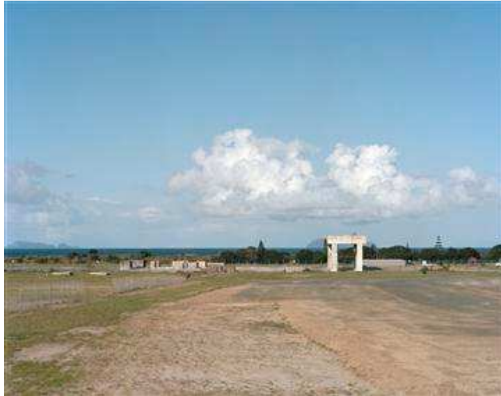
Site of the former Marsden B Power Station, Marsden Point, 24th August 2012