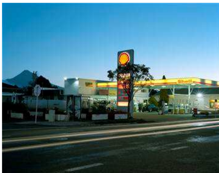
The Peak of Mt. Taranaki and Shell Station, Inglewood, 15th April 2012