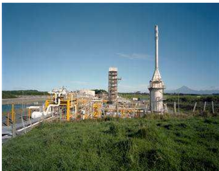
Pohokura Production Station, Motunui, 18th April 2012