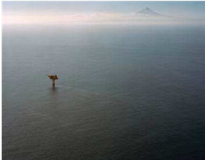
Kupe Natural Gas Field (unmanned Wellhead Platform), Tasman Sea, 20th July 2012