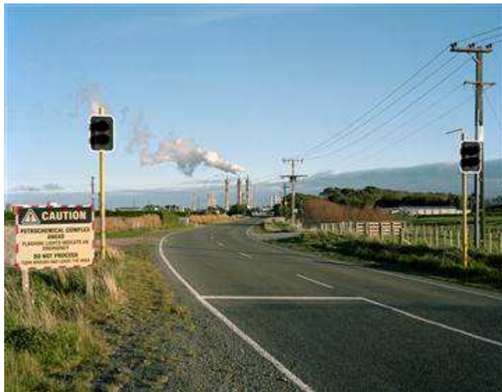
Production Station & Gas Treatment Plant, Kapuni, 16th April 2012