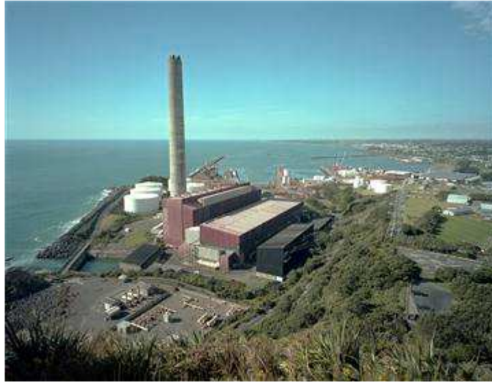
New Plymouth Power Station, Port Taranaki, New Plymouth, 17th April 2012

Photographed on Kodak 160 Portra 4x5" analogue film Digitally scanned to become Pigment ink photographs printed on Hahnemuhle PhotoRag 308gsm