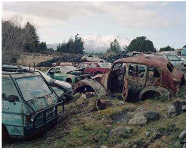
Horopito Motors, Horopito, 21st July 2012